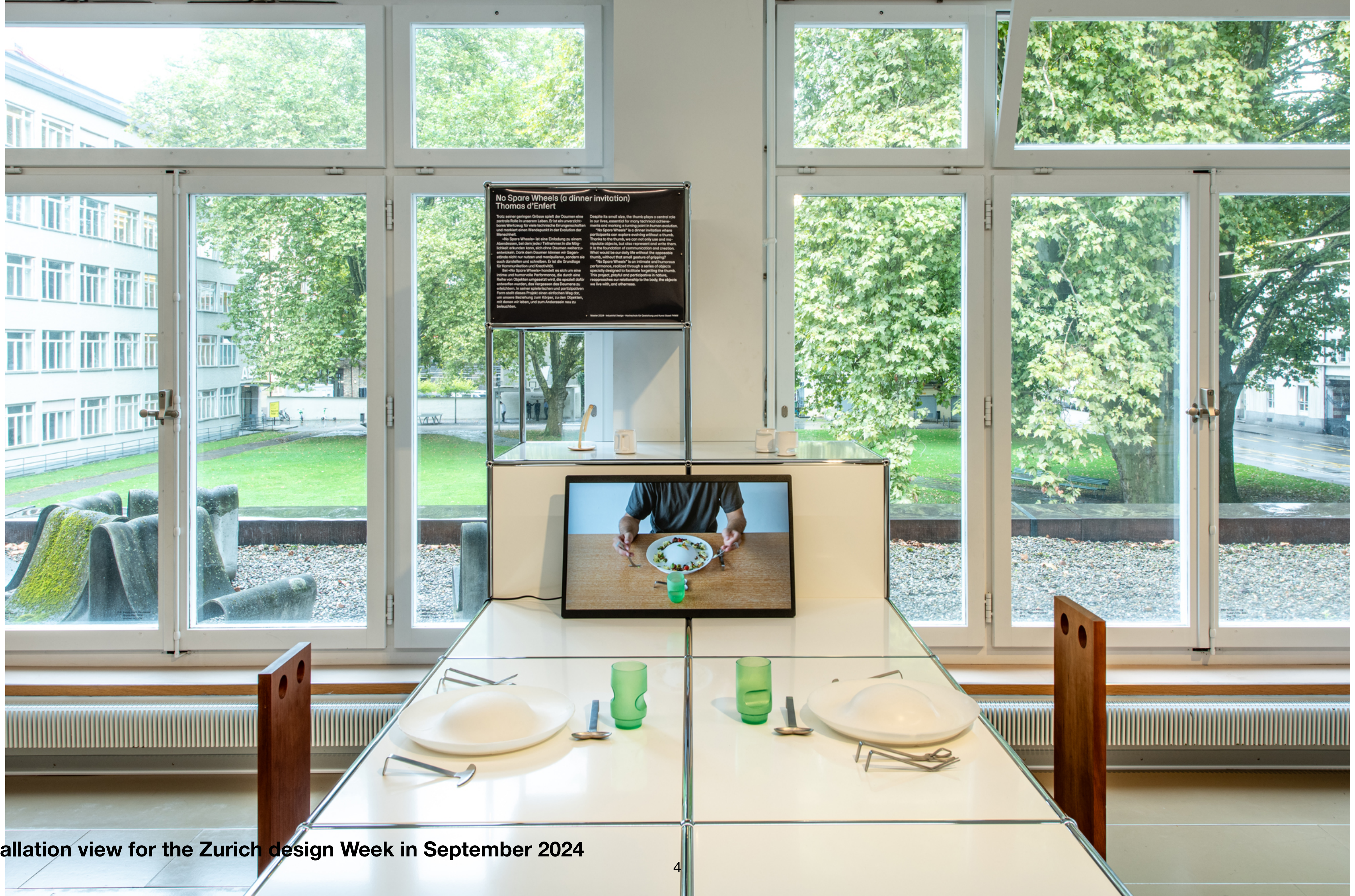
Installation view for the Zurich design Week in September 2024